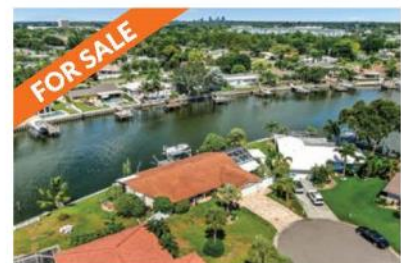
4300 39th St S 3 Bed | 2 Bath | 2,445 SF Listed @ $1,699,000