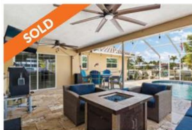
3801 48th Ave S 4 Bed | 2 Bath | 1,867 SF Last Listed @ $1,450,000