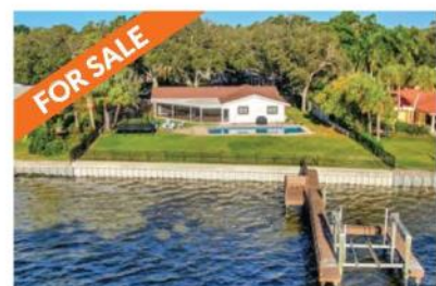
5820 Bahama Shores Dr S Bahama Shores 3 Bed | 2 Bath | 1,879 SF Listed @ $1,499,000