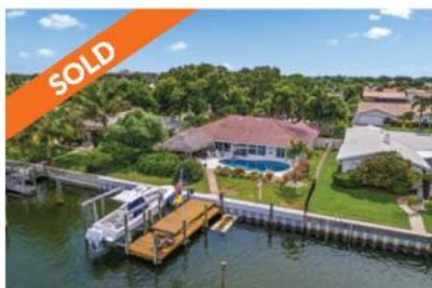
4360 39th St S 3 Bed | 2 Bath | 2,489 SF Last Listed @ $1,875,000