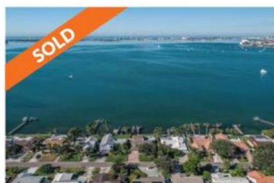
4401 45th St S 3 Bed | 2.5 Bath | 2,739 SF Last Listed @ $1,830,000