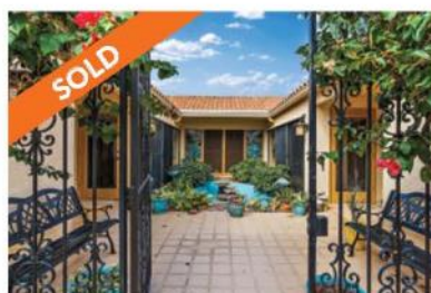
4385 48th Ave S 3 Bed | 3 Bath | 2,739 SF Last Listed @ $1,675,000